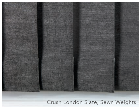
Crush London Slate, Sewn Weights