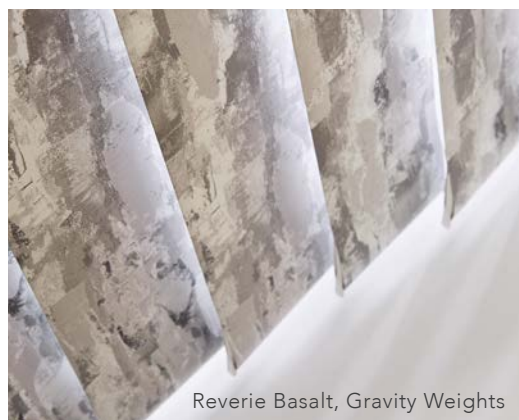
Reverie Basalt, Gravity Weights

For a contemporary aesthetic there's the option of 'sewn in' weights and 'gravity weights', removing the need for chain and finishing off your blind perfectly.